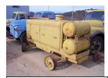
Davey Air Compressor 125cfm Gas, 2-axel Motor Transport Museum Ref.#RN702