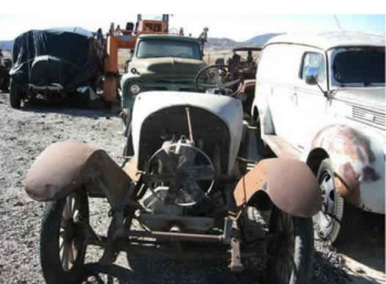
1915 White Car No Body, Extra parts Motor Transport Museum Ref.#RN1093