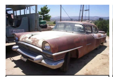
1953 Packard Clipper 4door, V8, Straight Body Motor Transport Museum-Ref.#RN388