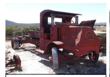
1927 Mac Truck Cab and Chassis Motor Transport Museum Ref. Carl Calvert