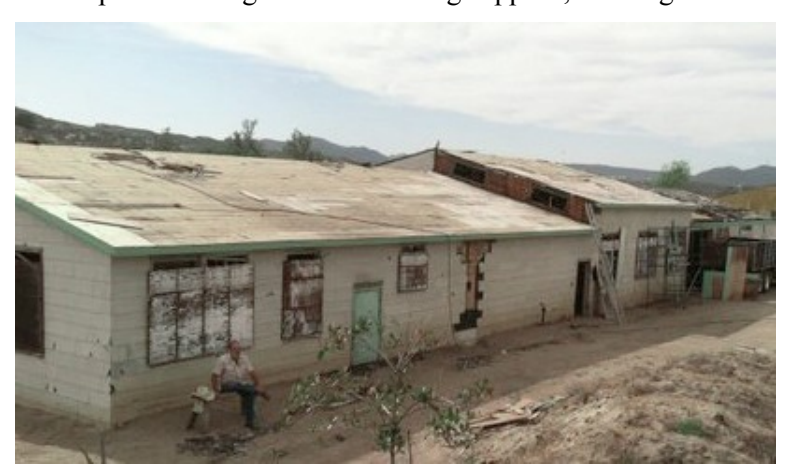
Camp Lockett building 605 with the old roof showing years of weathering. MTM volunteers will remove the old roof, restore the underlayment and then the roofing contractor will install the new green roofing material.

We plan on using the same roofing supplier, Roofing