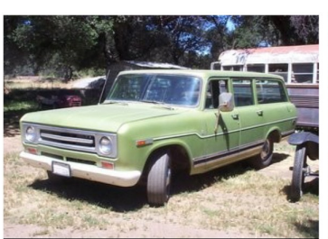
1969 International Travelall V8, 65,269 original miles Motor Transport Museum Ref. Carl Calvert